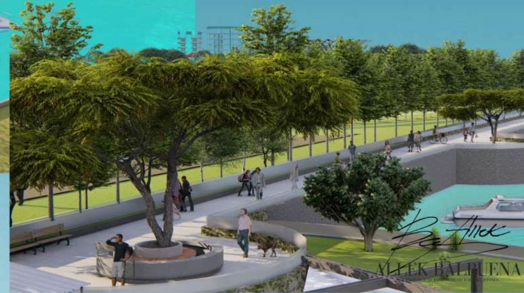
JOGGING LANE AND BOAT HARBOR